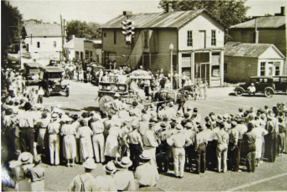
Forget Me Not Florist Location