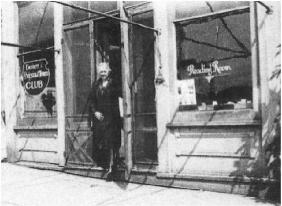
The first library in Fort Recovery

In 1928 a Reading Room became a reality for those who loved to read. The Business and Professional Women's Club led the search for books-asking citizens to donate for the cause and giving the town its first library. In 1938 the library moved to Fort Site Street.