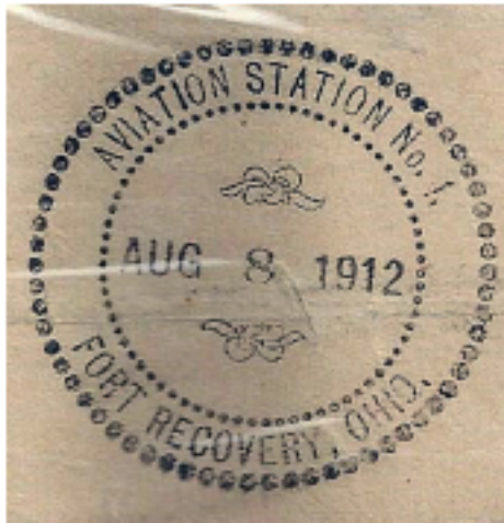
First Air Mail Flight Stamp