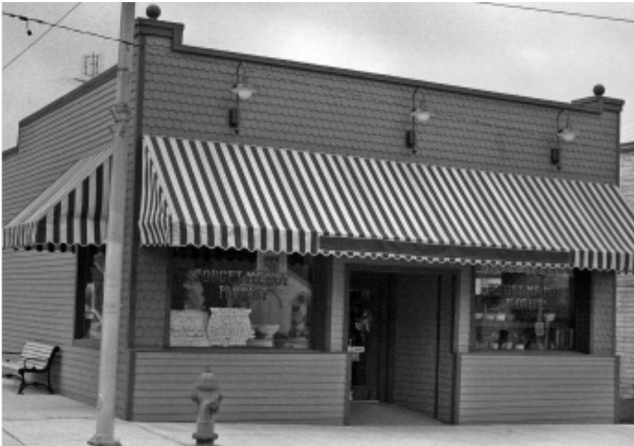
Forget Me Not Florist