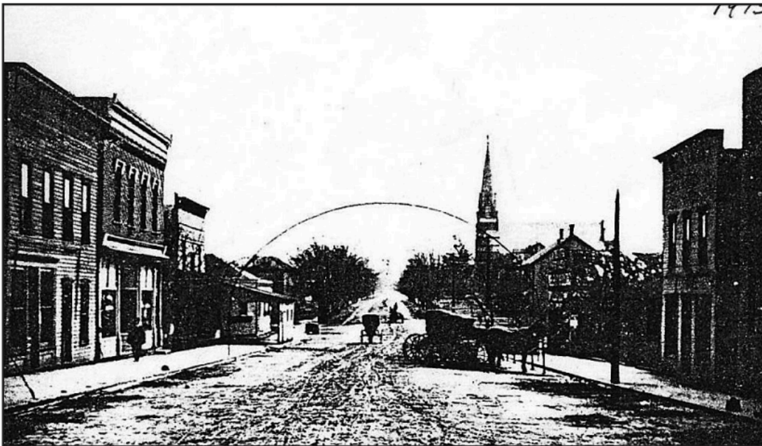
South Wayne Street - 1913