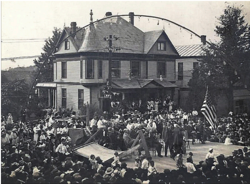
Krenning house in this Jubilee scene