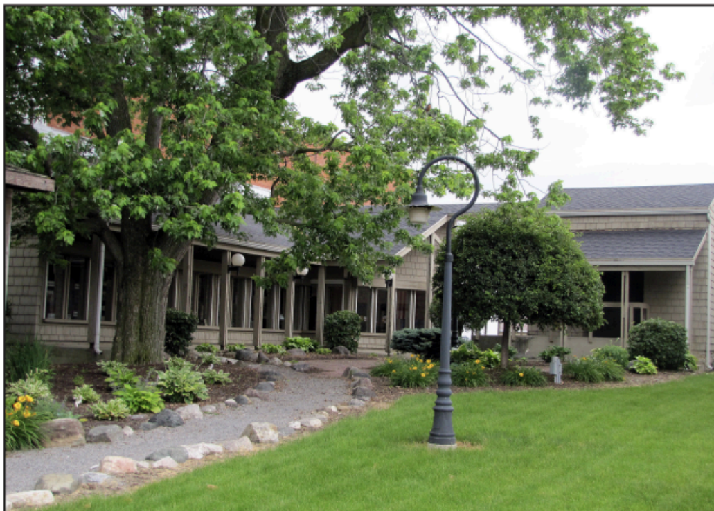
Fort Recovery Historical Society Walk-by Museum