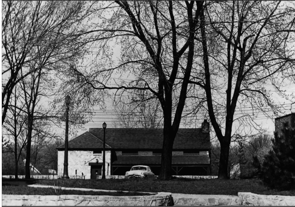
Fort Recovery State Museum as seen from Wayne Street