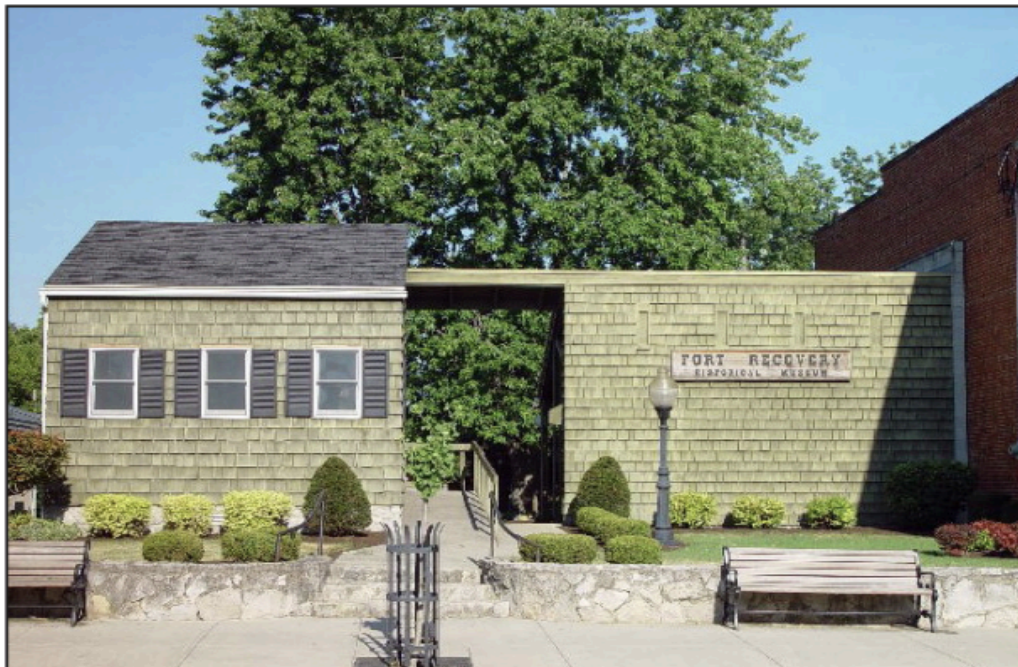
Fort Recovery Historical Society