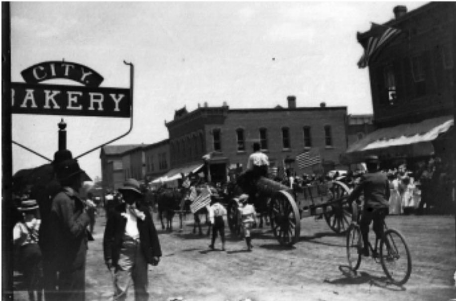
Parade passing by City Bakery on North Wayne Street