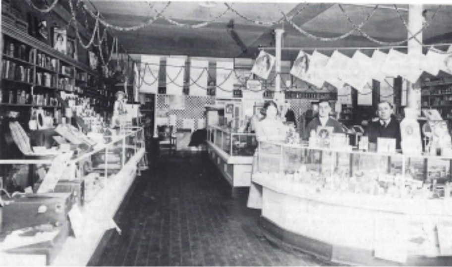
Zimmerman Drug Store

a watering trough for the horses stood on the corner opposite the side of the drug store. Public dances were held in the hall above the drug store. The sounds of pounding feet and loud music resounded loudly in the store below.