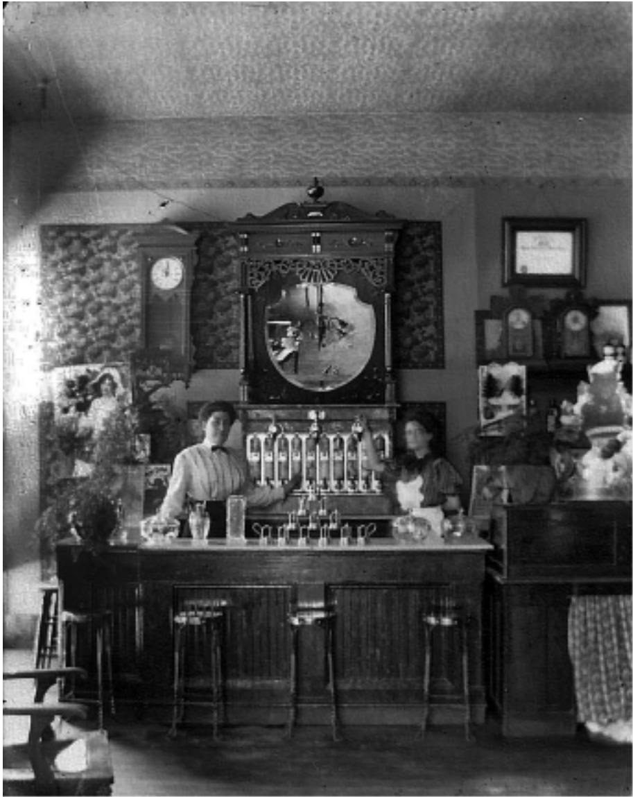
Adams Drug Store

For many years, two square pyramids made of these cannonballs stacked five high were in Monument Park next to the cannons. Cannonballs also lined the historic fort area on either side of the Fort Site Street and West Boundary Street. Art Huelskamp remembers how the cannonballs in Monument Park stayed perfect for many years until one year kids would occasionally undo the stacks. Art would be called in to help stack them back up.