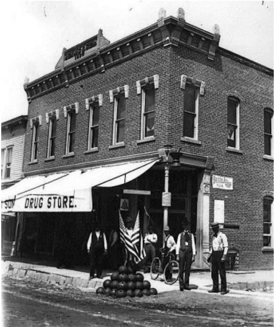
Adams Drug Store