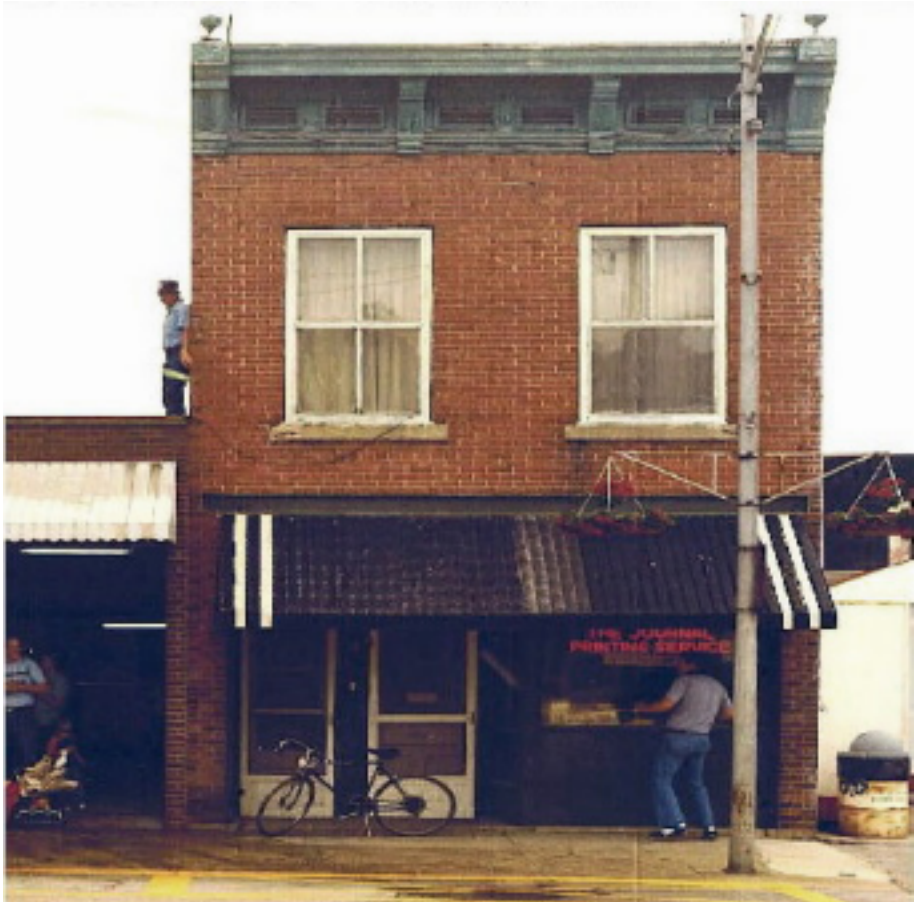
Old Journal Office