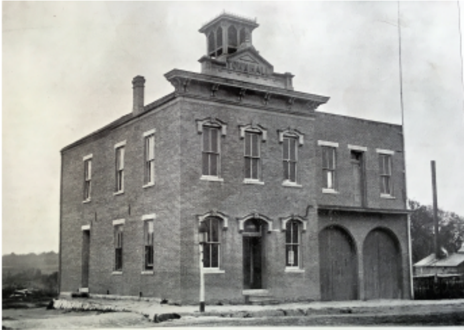
Town Hall 1878

Built in 1878, the city hall, as it was called then, had a 20x40 room used for town council meetings. In 1880 Carpenter William Hanna built the great table for this room. A jail was in the back of the building.